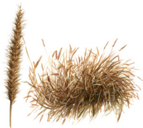
buffelgrass ( Pennisetum ciliare )

Take note! Through their ability to aggressively promote fire, these two African grasses are poised to destroy the Sonoran Desert as we know it: