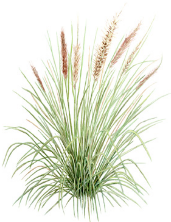
fountain grass ( Pennisetum setaceum )